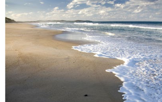
Wooli Beach – Northern New South Wales

Maybe I have always collected souvenirs of journey as signifiers of the substance of place. The walks along the beach in a place we have called home from time to time during the last 22 years has revealed much about human impact on this local and more global environment. From fires, floods, cyclones, and eroding tidal flows, I have seen many stories left on the beach over time.