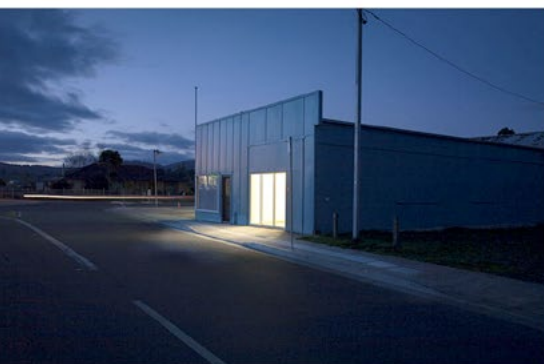
NOCTURNE: Cygnet servo back door