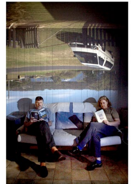
CAMERA OBSCURA: Reading - Wooli Beach House