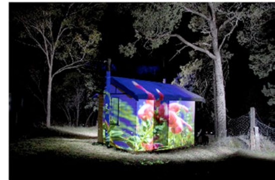
PROJECTION: Laundry Avochie Cottage, Myall Park Botanic Garden