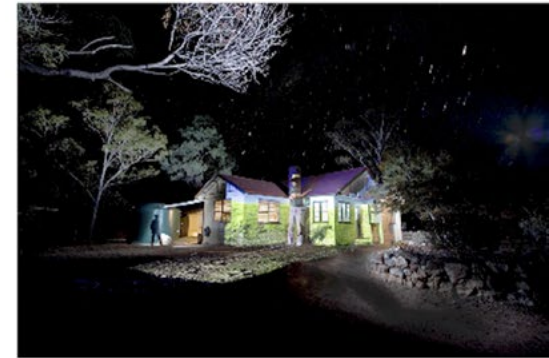
PROJECTION: Avochie Cottage, Myall Park Botanic Garden