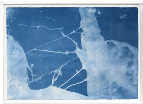
CYANOTYPE: White Shadow

The book itself also becomes a performative reading experience referencing the movement of the waves and the wind.