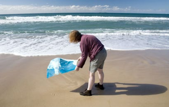
Wooli Beach – Making the kenetic cyanotype