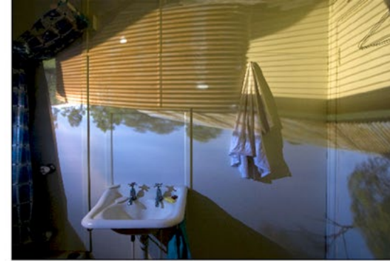
CAMERA OBSCURA: Bathroom Myall Park

For many years we travelled in a Tarago van that we converted into a camera obscura. As with our many other HOME environments, each of our excursions into the field or town were an investigation of journey and place.