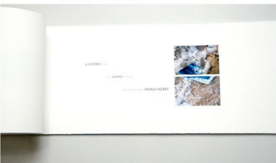
WHITE SHADOW – the book (detail)