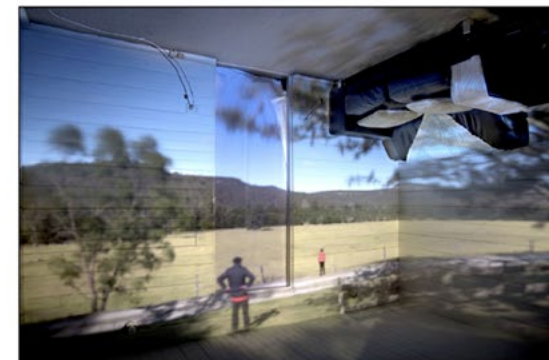
CAMERA OBSCURA: CarCamera - jetty volcano lake