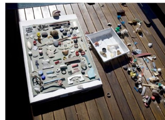
Making Wooli Beach Junk