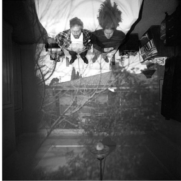
CAMERA OBSCURA: Bedroom, Toowoomba