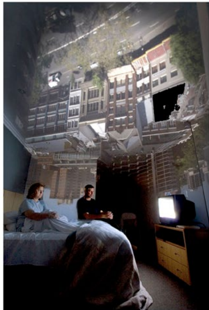
CAMERA OBSCURA: We were watching TV - Travelodge Hotel, Sydney