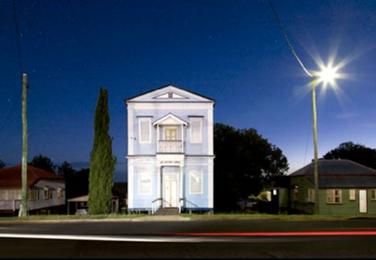
NOCTURNE: Childers Masonic Lodge