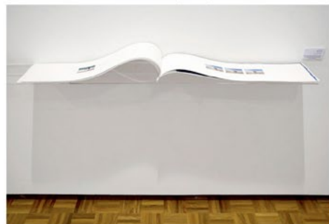
WHITE SHADOW – the book displayed