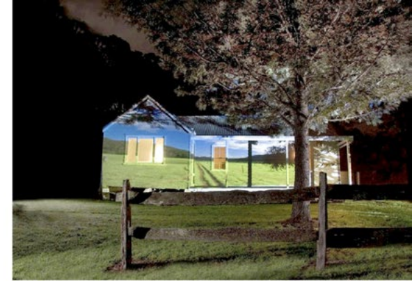
PROJECTION: Writer's Cottage, Bundanon

Central to this work is the importance of portraying the connection between things: History and present, the personal narratives imbued by a life in the landscape, Human habitation and land use and the land's response.