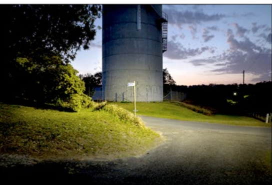
NOCTURNE: Woolli beach sign