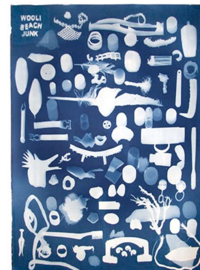
CYANOTYPE: Wooli Beach Junk