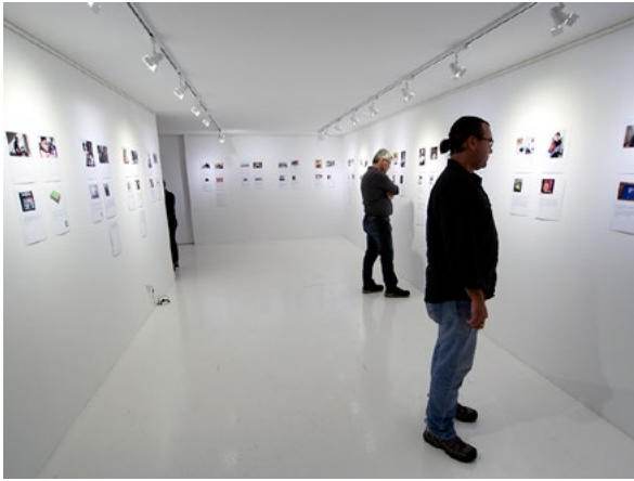
The front space at The Maud Street Photo Gallery SEE: https://www.maud-creative.com/about/